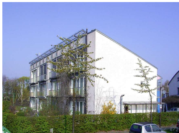
First Passive House built in 1991 in Darmstadt-Germany

This developed the planning package and initiated the production of the novel components that had been used, notably the windows and the high-efficiency ventilation systems. Meanwhile further passive houses were built in Stuttgart (1993), Naumburg, Hesse, Wiesbaden, and Cologne (1997).