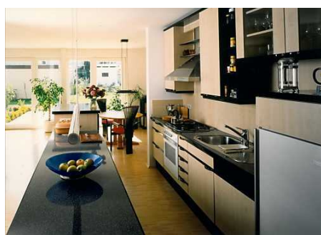
Inside the first Passive House

A Passive House is a very well insulated, virtually air tight building that is primarily heated by passive solar gain and by internal gains from people, electrical equipment, etc. Energy losses are minimized. Any remaining heat demand is provided by an extremely small source. Avoidance of heat gain through shading and window orientation also helps to limit any cooling load, which is similarly minimized. A heat recovery ventilation system provides a constant, balanced fresh air supply.